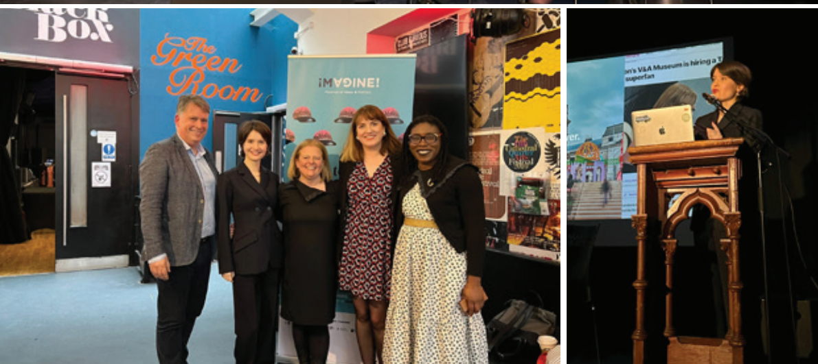
Part of Imagine! Belfast – Festival of Ideas and Politics.