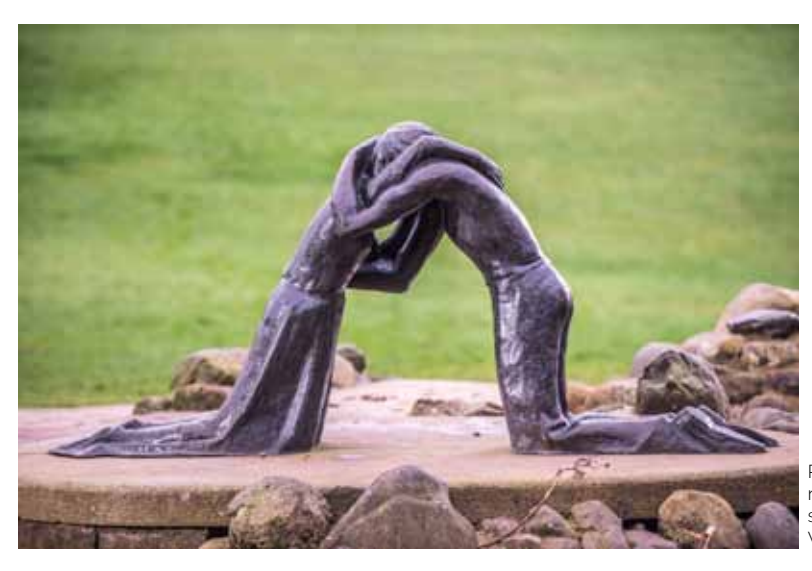
Reconciliation (originally named Reunion) is a sculpture by Josefina de Vasconcellos.