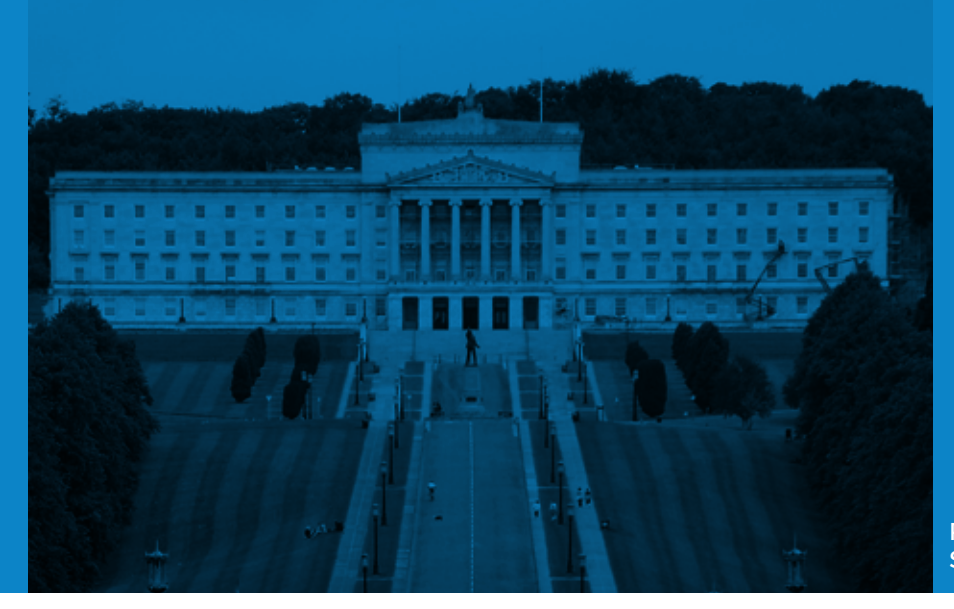
Parliament Buildings, Stormont