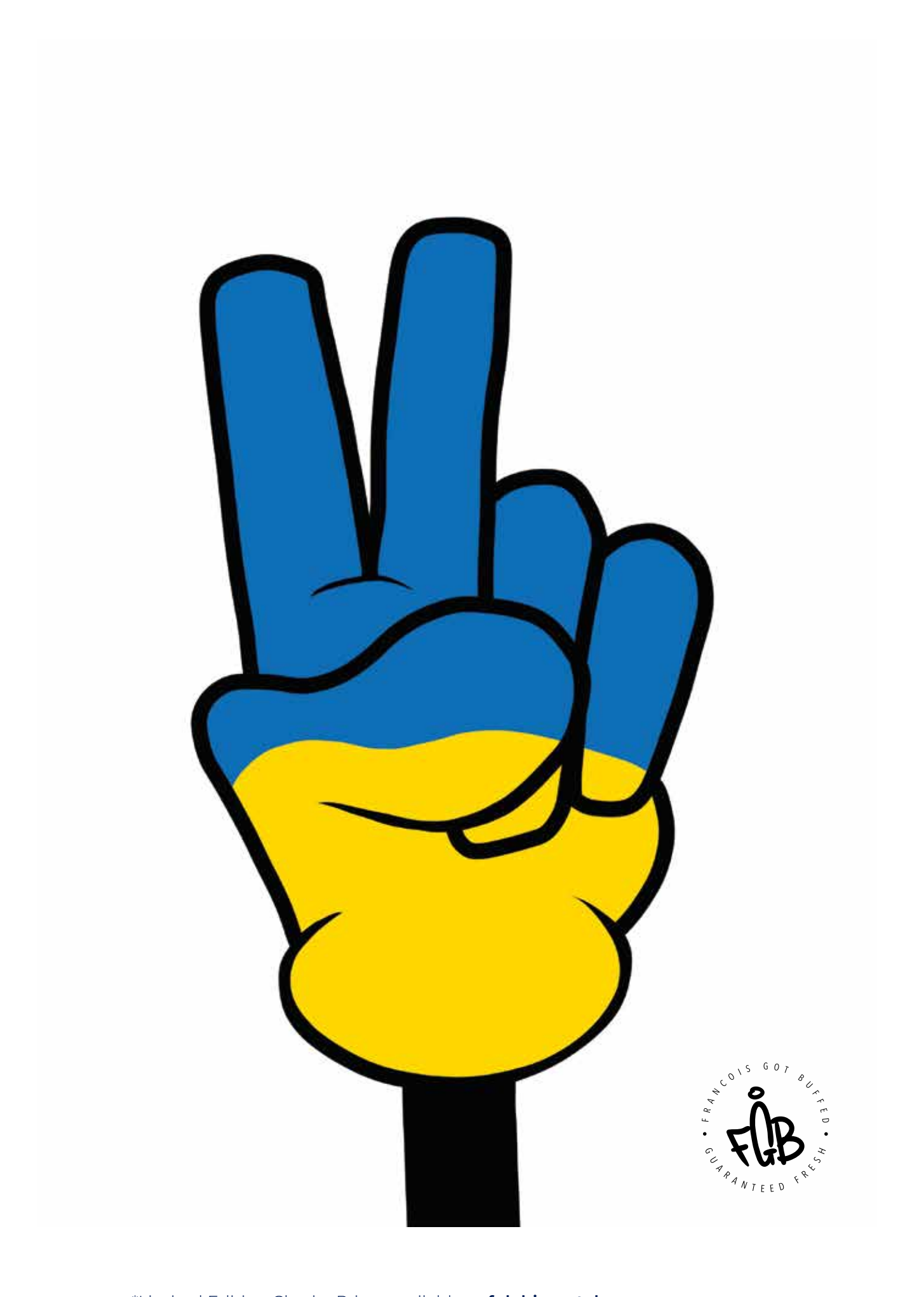
*Limited Edition Charity Prints available at fgb.bigcartel.com 100% profits go to the International Red Cross Disaster Emergency Committee