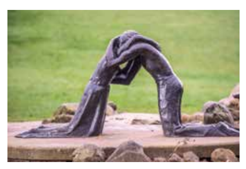
Front cover: Reconciliation (originally named Reunion) is a sculpture by Josefina de Vasconcellos. Bronze casts of this sculpture can be found in Coventry, Hiroshima, Berlin and Stormont.